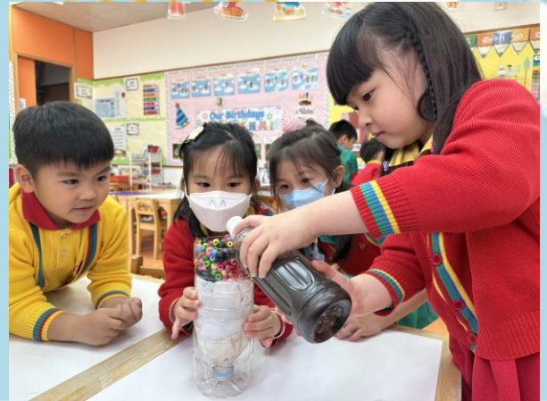
This is how we can filter dirty water into clean water.