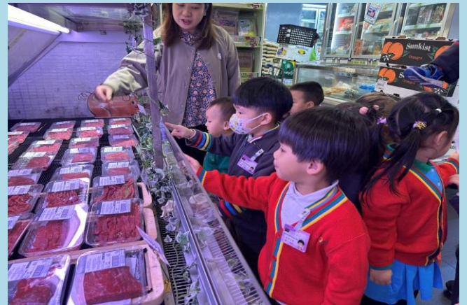
Look what we found in the supermarket! 看看我們在超級市場裏發現了甚麼！