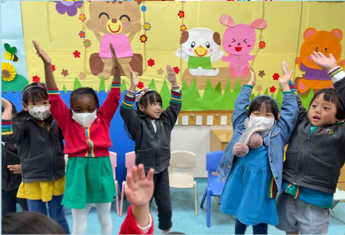
'So La Ti Do' The flowers are open. 花兒開了!