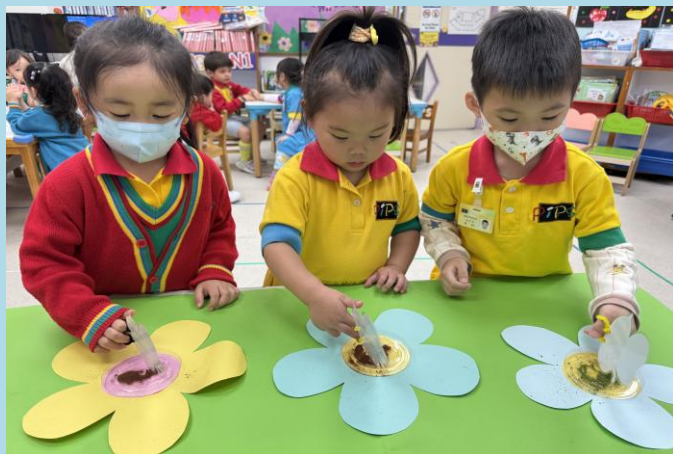
Wow! This is the process of pollen dissemination. 哇！這是花粉傳播的過程。