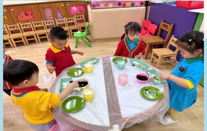
We are cooking delicious banana yogurt sticks! 小廚師們正在製作美味的香蕉乳酪棒！