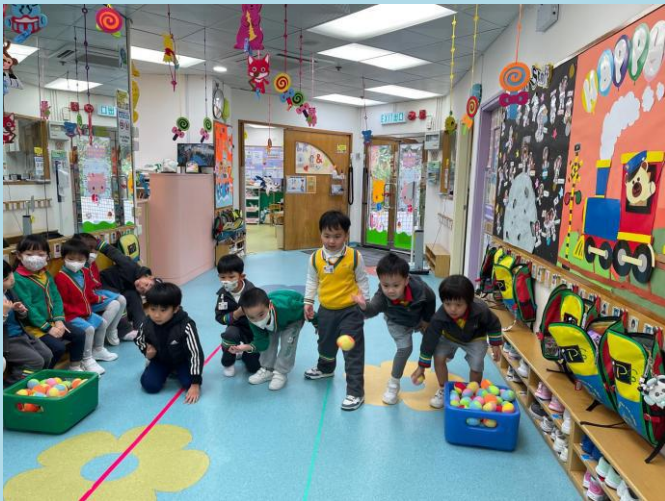
We can roll the balls to the target. 滾啊滾，我們的球滾到目標位置，厲害嗎?