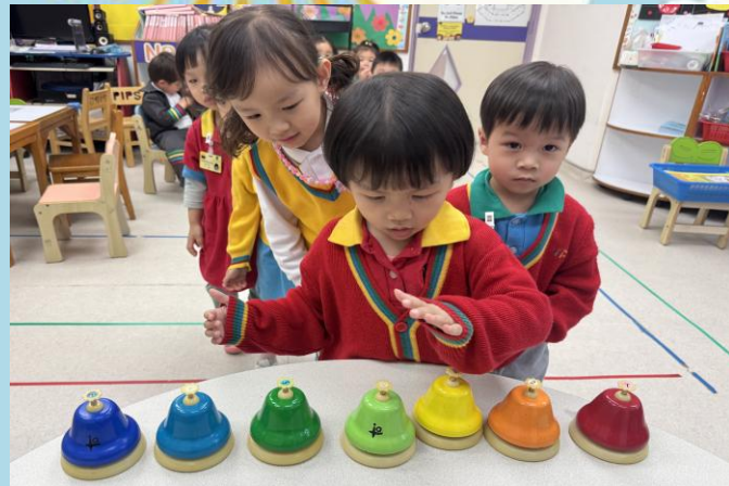
We are playing the rainbow bell, it's fun! 我們正在玩彩虹鐘，真有趣！