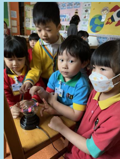
Look at the rays in the 'plasma ball'.