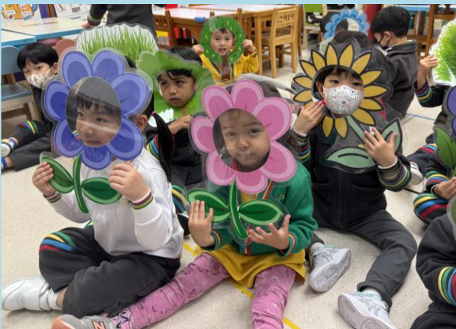
There are many flowers in the purple room. 紫色課室裡有很多花。