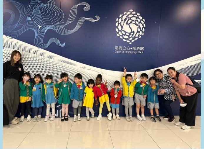
We saw many jellyfish inside the Cube O Discovery Park. 可以到「浩海立方」遊覽，很興奮啊!