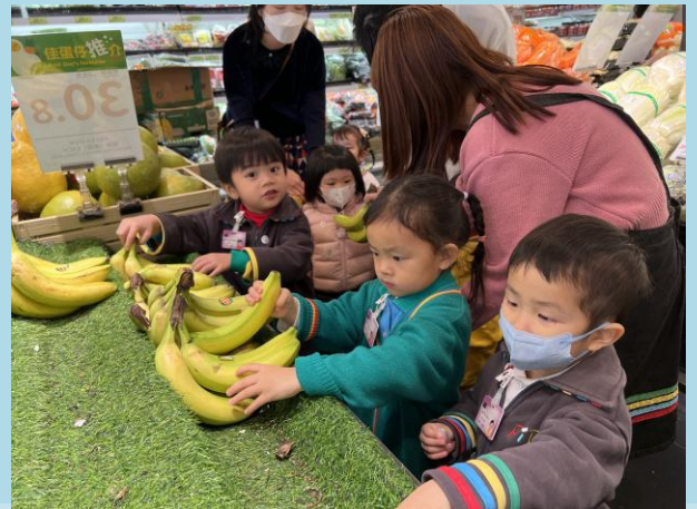
We are shopping in the supermarket. 我們到超級市場買香蕉去。