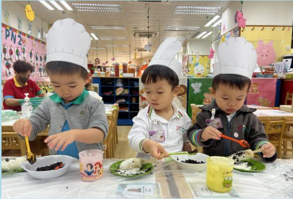
Our first time baking and cooking. Yummy! 我們第一次製作香蕉乳酪脆棒，好味道！