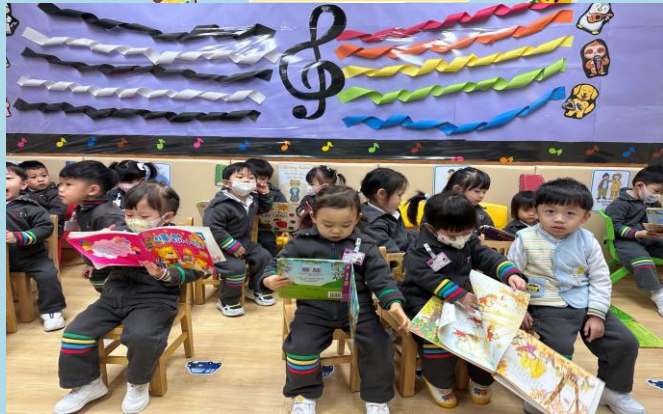
Please keep quiet, we are reading a story! 請保持安靜，我們正在看圖書！