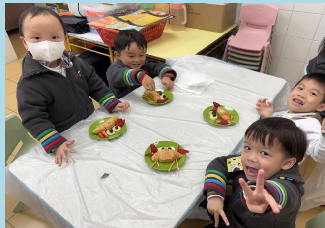
Look! We made the 'Clumsy Crab' for our snack time, cute? 看！我們製作的茶點「小螃蟹」可愛嗎？