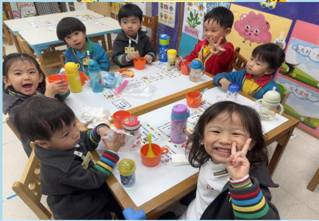
Let's prepare honey water drinks together. 我們一起調製蜜糖水。