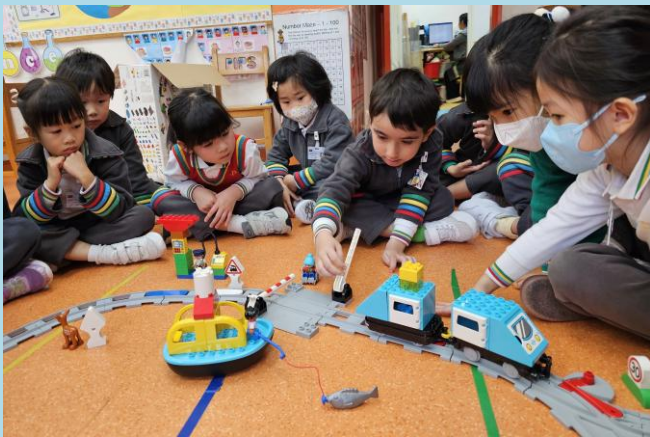
Open the gate for our STEM train to pass through!