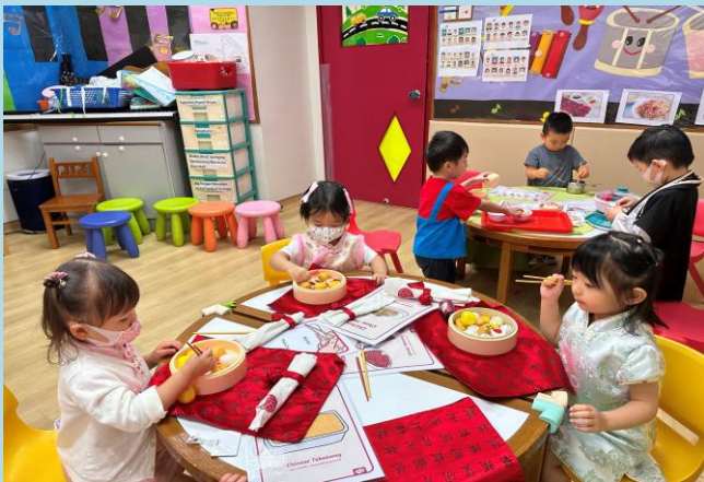
I want some siu-mai, thank you! 我想要一籠燒賣，謝謝！