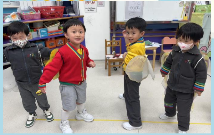
Look at our wings, we are flying like butterflies. 看看我的翅膀，我們像蝴蝶一樣飛翔。