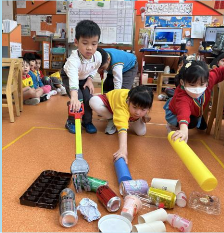
Beach clean up!