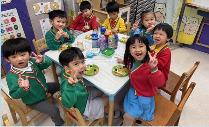
We made a butterfly and are ready to 'eat' it! 我們做了一隻蝴蝶並準備「吃」牠！