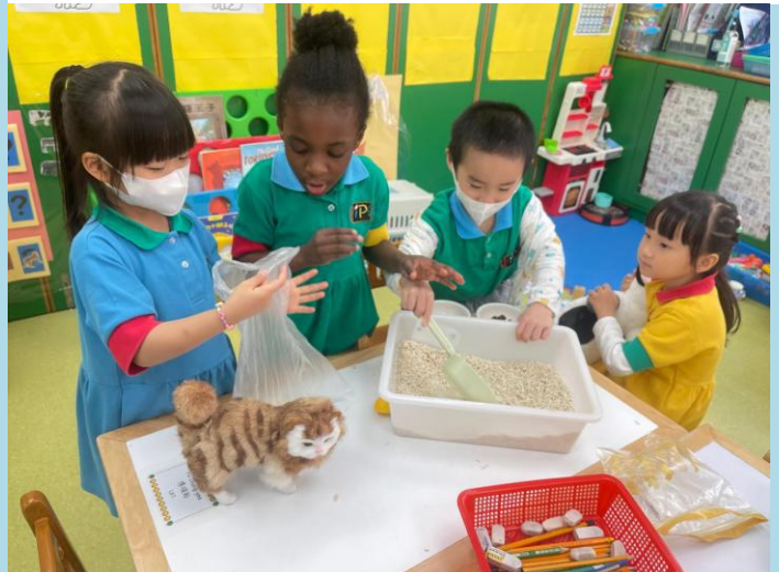
We know how to take care of cats. 我們會好好照顧花貓。