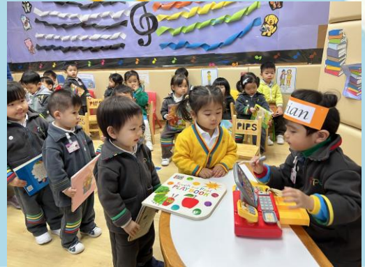
Please keep quiet in the library! 噓！圖書館內要保持安靜啊！