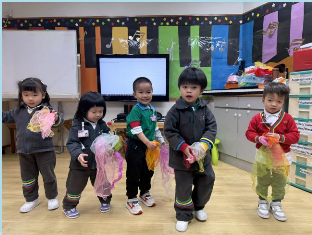
Fly, fly, fly the butterfly. 我們像蝴蝶般翩翩起舞呢！