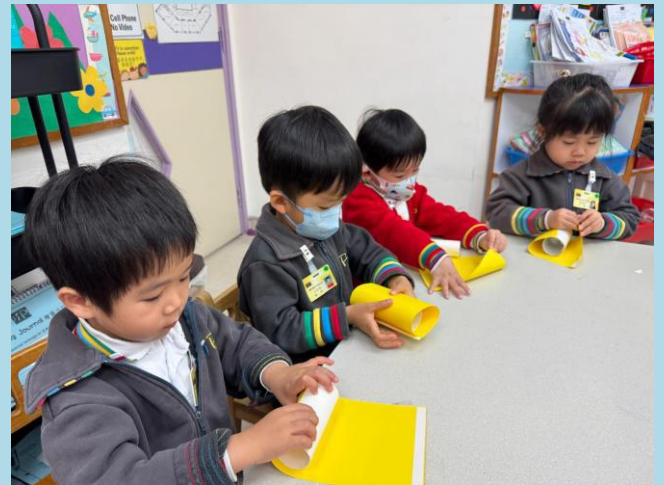
Buzz, buzz, we are each making a bumble bee. 嗡嗡，我們正在製作一隻大黃蜂。